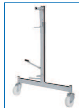
New lifting roller stand "Safe & Comfort"