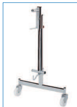
lifting roller stand