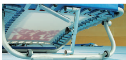
Adjustable foot support and wheels