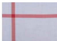
Jumping bed School